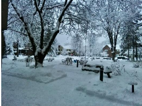
Snow at Neill

Here are a few pictures of the aftermath of the historic snowfall from Neill and Seal Hi-Rises.