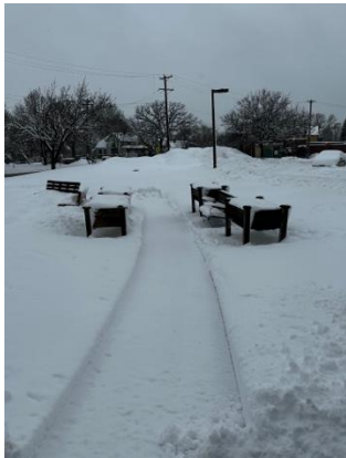
Snow at Seal