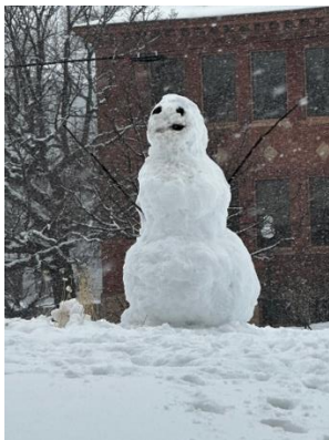
Making the most of the situation, at Seal